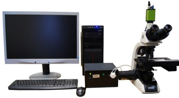
1 M-9 platform