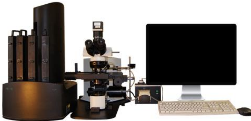
200 O-9 platform