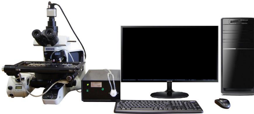
8 O-9 platform